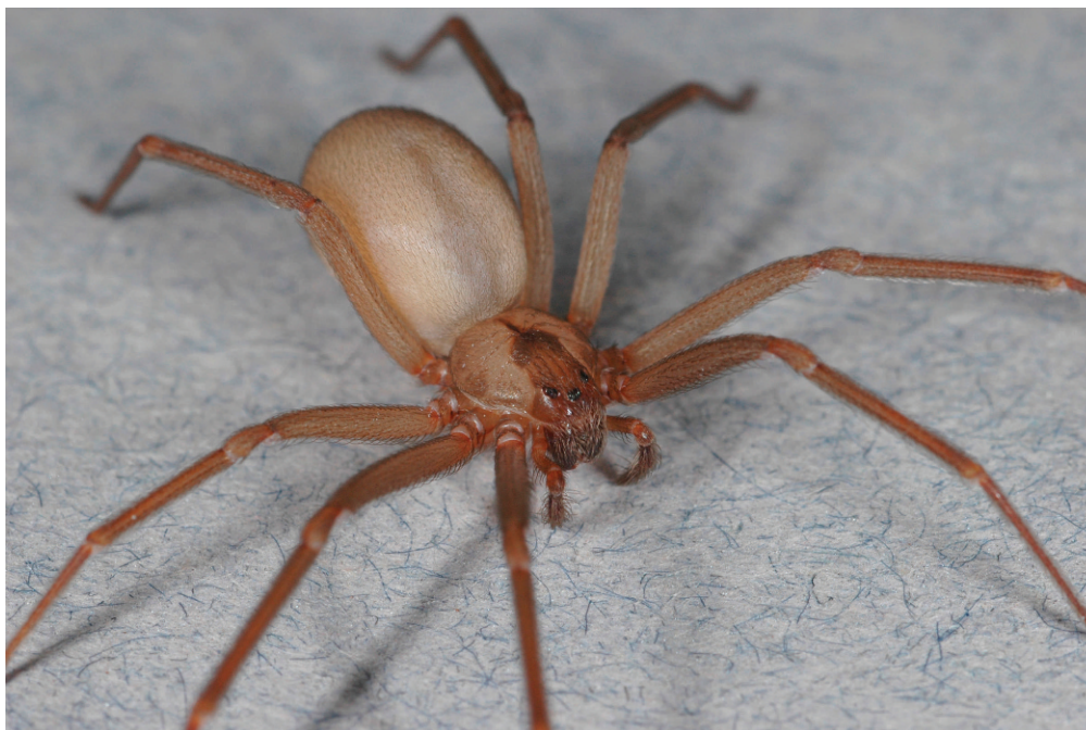
Figure 1.—Brown recluse spider, Loxosceles reclusa Gertsch & Mulaik.

They are ecribellate, haplogyne spiders that are rather primitive as is evident by the simplistic genitalia, which makes differentiation among the many species somewhat challenging.