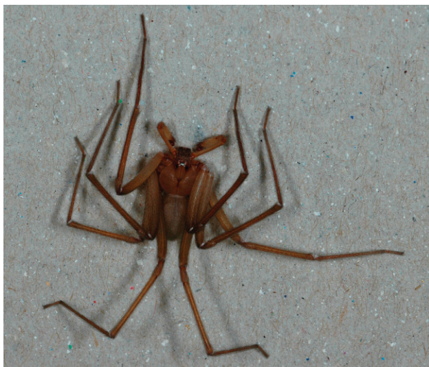
Figure 2.—Male Loxosceles laeta (Nicolet) showing the slanted leg position when resting. Note the palpal femora and tibia, which are exceptionally long compared to North American Loxosceles species.

The most comprehensive source for North America Loxosceles distribution information is the genus revision of Gertsch & Ennik (1983). Their distribution map consists of dots representing collections of L. reclusa in North America. As such, a dot in New York may signify one itinerant, transported specimen found in a hotel while a map dot for a location in Kansas represents thousands to millions of L. reclusa in a widespread area where populations are consistent,